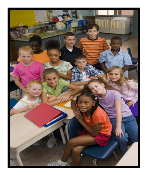
As a total force, we can ensure our children reach their highest potential and with as few educational transitional issues as possible.