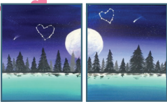
This month's featured two-piece couples painting

FREE VALENTINE'S DAY THEMED DRINK WITH PURCHASE