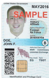
Common Access Card

Active Military Foreign Affiliate Eligible only with this ID (no other ID accepted)