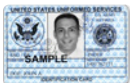
DD Form 2 (Retired)

100% Disabled Veterans Medal of Honor Recipients Some Retirees Eligible