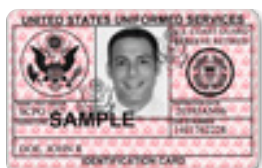
DD Form 2 (Reserve Retired)

Retired Reserves Retired National Guard Eligible