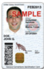
Common Access Card