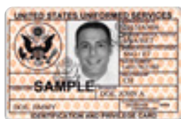
DD Form 2765

100% Disabled Veterans Medal of Honor Recipients Other Benefits-eligible Categories Eligible