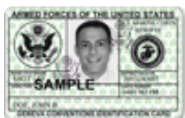
DD Form 2 (Reserve)

Eligible Service Members are active or retired members of the U.S. military, including the National Guard, Reservists, the U.S. Coast Guard, the U.S. Space Force, the Commissioned Corps of the U.S. Public Health Service (USPHS), and the Commissioned Corps of the National Oceanic and Atmospheric Administration (NOAA). Eligible Service Members (or their spouses) must present valid military identification pictured below.