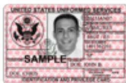
DD Form 1173-1

Retired Reserves Retired National Guard Eligible