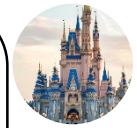
Magic Kingdom & Animal Kingdom