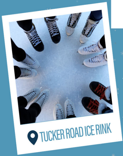
TUCKER ROAD ICE RINK