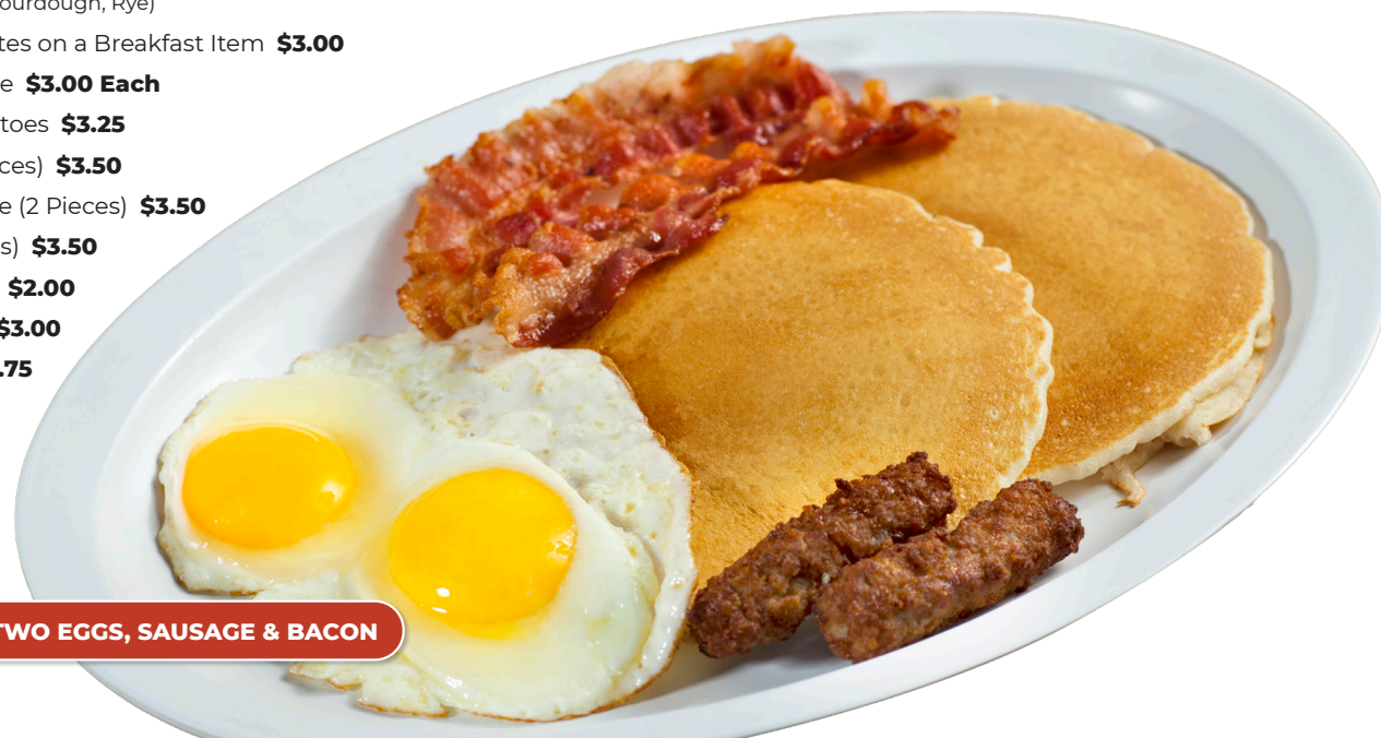
PANCAKES, TWO EGGS, SAUSAGE & BACON