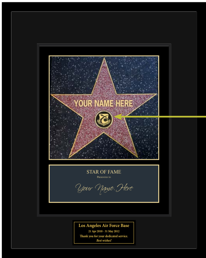
Includes frame, photo quality print, and laser engraved plastic plate.

Select this option if you will be providing another image instead of the Hollywood Star. Frame, print and engraved plate are still included for the same price.