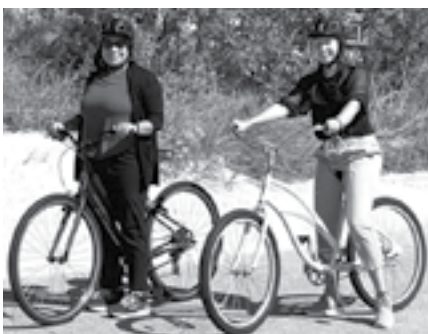
-Prices are subject to change without notice-

Reservation can be made by calling the Base Marina at (813) 828-4983.