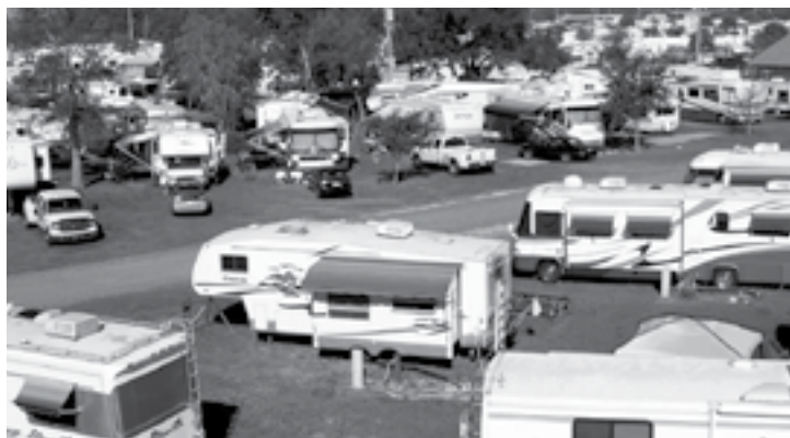
-Prices are subject to change without notice-

*Electric/water/sewage/cable TV & optional phone (where available)