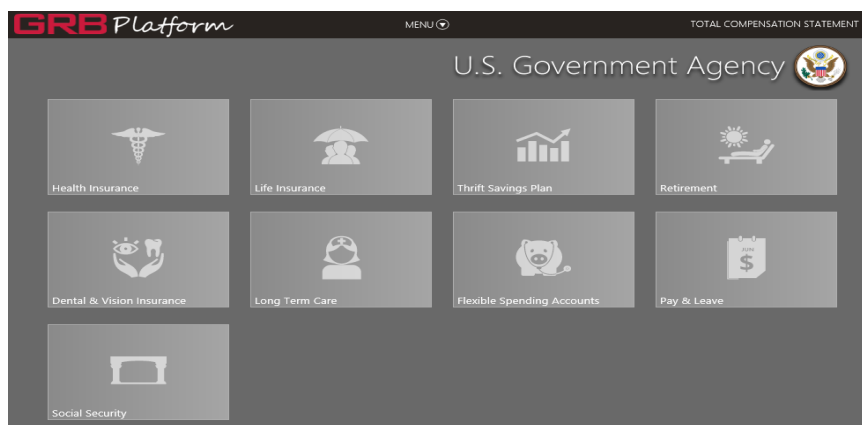
[GRB Main Menu]

Your temporary PIN is based on your date of birth - four digits consisting of the 2 digit month and the last 2 digits of your year of birth. If you have forgotten your six digit PIN, the required information can be found on your most recent Leave and Earnings Statement or SF-50 (Notification of Personnel Action). Your PIN must be a combination of numbers that are not easily identifiable; it cannot repeat the same number, equal the first or last six digits of your social security number, equal your date of birth or service computation date for leave, and cannot include any single number repeated three or more times. When entering your date of birth and service computation date follow the format shown on the screen and be sure to include the slashes.