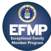
EFMP Family Support