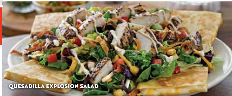
QUESADILLA EXPLOSION SALAD