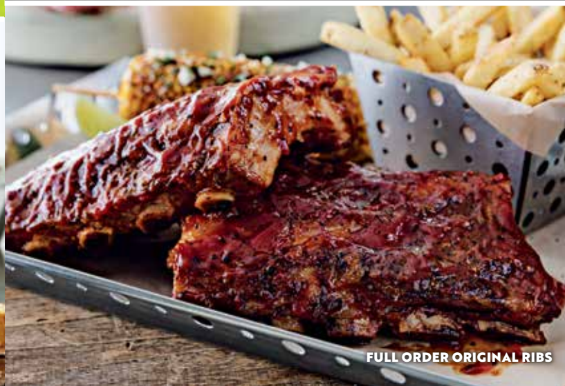
FULL ORDER ORIGINAL RIBS

WORLD FAMOUS! FALL-OFF-THE-BONE GREATNESS.