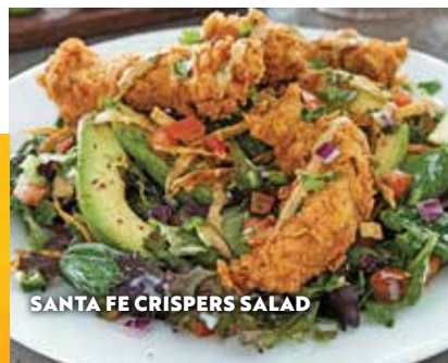
SANTA FE CRISPERS SALAD

Hand-breaded crispy chicken tossed in spicy Buffalo sauce, bacon, bleu cheese crumbles, house-made pico and tortilla strips with house-made ranch on mixed greens. 14.00