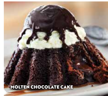
MOLTEN CHOCOLATE CAKE

Warm chocolate cake with chocolate fudge filling. Topped with vanilla ice cream under a crunchy chocolate shell. 7.50