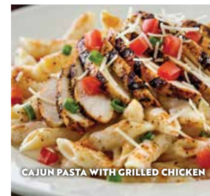
CAJUN PASTA WITH GRILLED CHICKEN