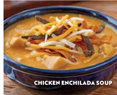
CHICKEN ENCHILADA SOUP

Our original recipe with beef, onions and a signature blend of spices. Topped with cheese & tortilla strips. Bowl 5.50 Cup 4.75