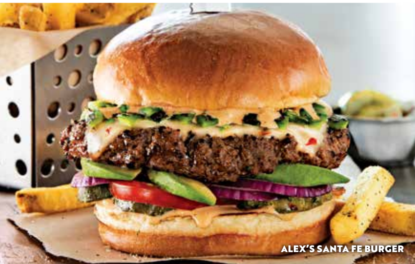
ALEX'S SANTA FE BURGER

MADE WITH 1/2 POUND PATTIES HAND-CRAFTED FRESH TO ORDER. SMASHED TO LOCK IN FLAVOR ON A TOASTED BRIOCHE BUN. SERVED WITH GARLIC DILL PICKLES OR SAUCE & FRIES.