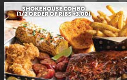
SMOKEHOUSE COMBO (1/2 ORDER OF RIBS +3.00)