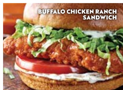
BUFFALO CHICKEN RANCH SANDWICH

Spicy, Cajun-style grilled chicken breast, jalapeño Jack cheese, lettuce, tomato, pickles, ancho-ranch dressing, onion rings. 12.00