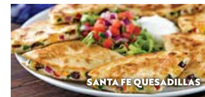
SANTA FE QUESADILLAS

Three spicy chile-lime shrimp tacos in flour tortillas with house-made pico, avocado, cilantro, coleslaw, queso fresco. Served with rice & black beans. 13.95