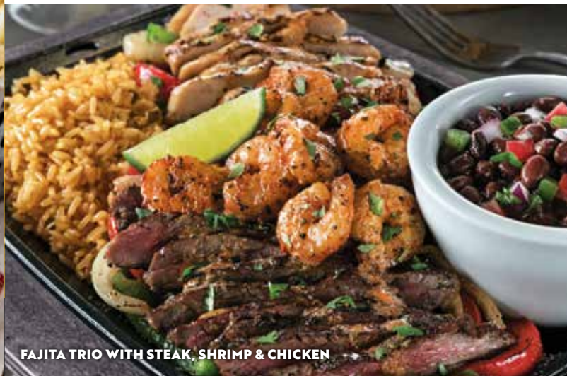
FAJITA TRIO WITH STEAK, SHRIMP & CHICKEN

SIZZLING TO THE TABLE WITH BELL PEPPERS AND ONIONS, TOPPED WITH GARLIC BUTTER AND CILANTRO. SERVED WITH RICE, BLACK BEANS AND FLOUR TORTILLAS.