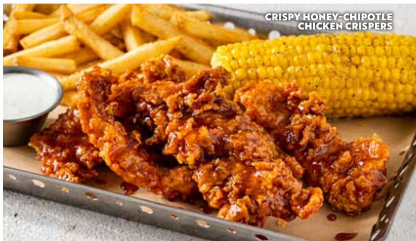
CRISPY HONEY-CHIPOTLE CHICKEN CRISPERS

ALL-NATURAL 100% WHITE MEAT CHICKEN. SERVED WITH CORN ON THE COB & FRIES.