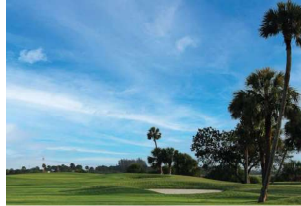
Tee times may be blocked for approved tournament or league play only.